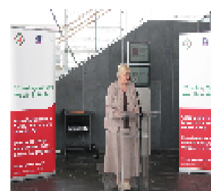
Gwenda Thomas AM, Deputy Minister for Health

WaMH in PC's 'Gold Standard Development and Awareness Day' was held at the Senedd, Cardiff Bay on Tuesday 23 rd June 2009. The event attracted 50 attendees including health care professionals, mental health voluntary sector workers, assembly members and other organisations with an interest in mental health.