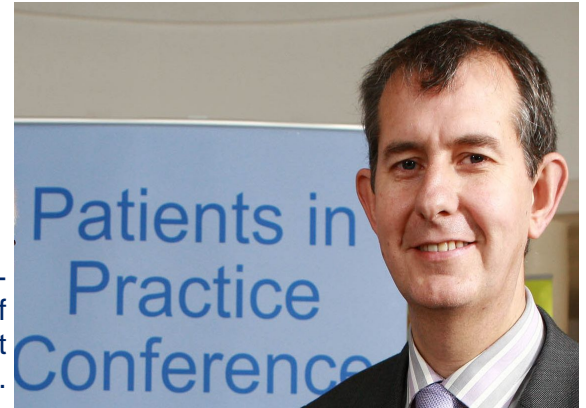
Mr Edwin Poots MLA (Minister for Health, Social Services and Public Safety)