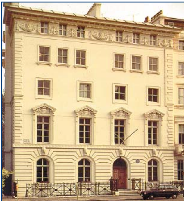
RCGP, 14 Princes Gate, London

I congratulate the RCGP on such a wonderful initiative and encourage my fellow GPs in the developing world to take this golden opportunity and expand on their experiences.