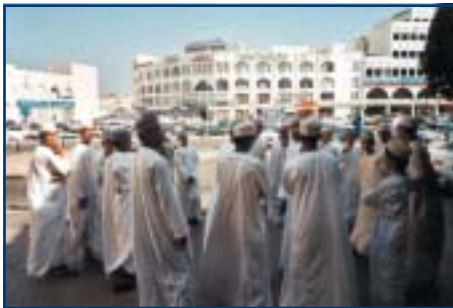
A group of Omanis in Muscat

The College has responded to colleagues in many parts of the world who wished to develop an internationally recognised postgraduate qualification for general practice/family medicine, equivalent in status to qualifications in hospital-based specialist disciplines. The College has become increasingly aware of the need for high quality postgraduate assessments to be developed at national or regional level in different parts of the world, tailored to local needs, culture, practice, health and educational systems.