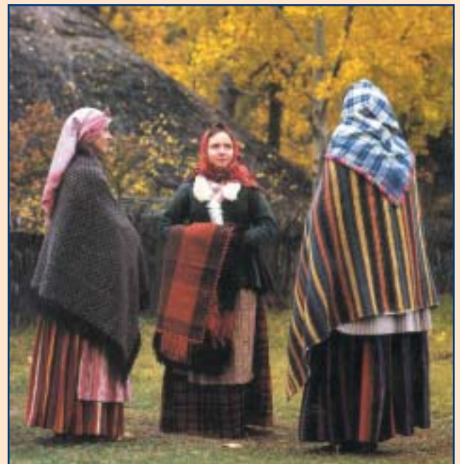
Lithuanian traditional dress