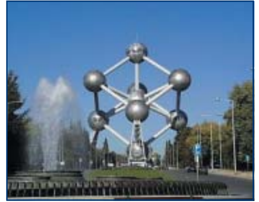
The Atomium, Bruxelles