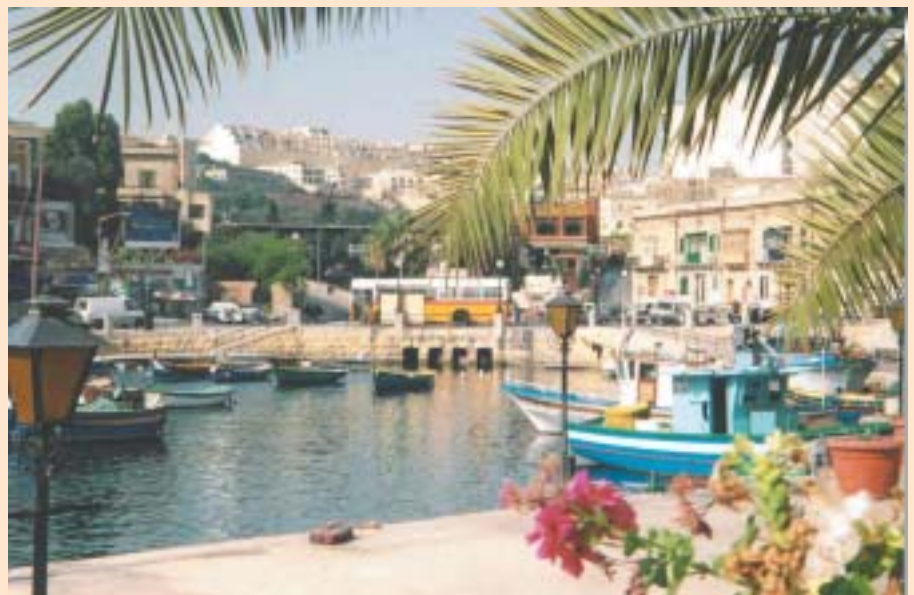
Spinola Bay - St. Julians, Malta

Contact the International Dept. of the College for details of future courses.