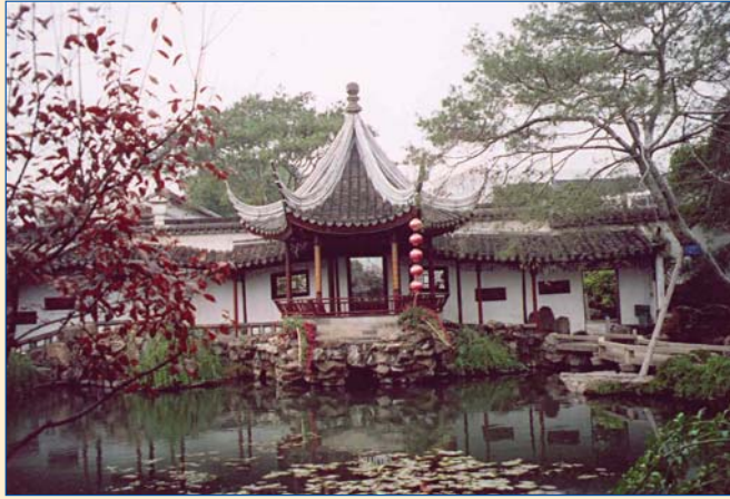
The Lingoring Gardens, Suzhou, China

One of the roles of the International Department of the College is to facilitate educational exchanges and visits. The aims of these are to promote international understanding, education, and friendship with a view to promoting high standards of general practice and family medicine.