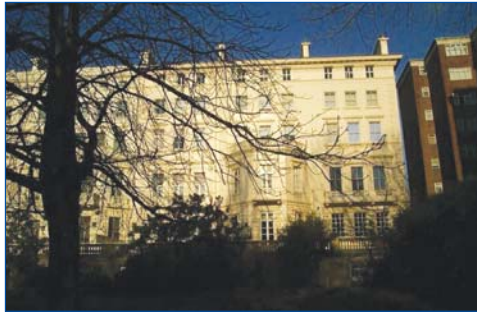
Royal College of GPs, Princes Gate, London

The purpose of my visit was to learn how the NHS is organised, the prescription policy, audit in Primary Care and how the programme of residence for the GPs is organised. By far all the aims of my visit were achieved and I would not change any part of my visit. However, my advice to others would be to firstly, organise the journey before you arrive in UK in order to find accommodation in the different cities and arrange a specific program; secondly, have a clear aim and tell it to the International team. One and a half years have passed since I enjoyed my visit and as I am in contact with doctors of Family Medicine, I encourage them to visit UK to see how the NHS is organized and how a GP works each day.