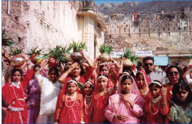
Festival procession in Bundi, India

College representatives have provided training input and accreditation advice in Kosovo and we have held International Teachers Programmes in both Malta and Cyprus . We look forward to longer-term collaborations with all these countries. Previous very successful programmes in Ukraine , Karelia and Kazakhstan have now concluded, but work continues in Russia , as does a long-term