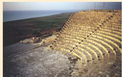
The theatre of Kourion, Cyprus

Successful courses have been held in England, Nepal, Pakistan, Bangladesh and are currently taught in Malta and Cyprus.