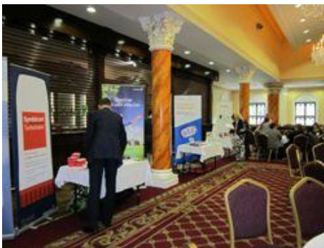
Above: Sponsor area at Practice Managers Conference

The First RCGP Practice Managers Conference took place on 14 September 2011 in the Tullyglass Hotel Ballymena. The event was attended by around 60 practice managers from across the province. The conference covered a range of topics relevant to general practice including QoF, Staff Management, Developing Integrated Care, Working with