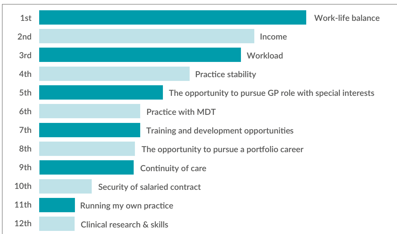
Figure 2: “What factors are most important to you in your GP career?” NI ST3 GP Trainees’ responses, ranking from most to least important 20

GP Trainees: While the majority of the almost 60 trainees who took part in the RCGPNI session with ST3s indicated that they planned to stay and work as a GP in Northern Ireland, around 17% were planning to work elsewhere or were undecided about their plans post-CCT. In relation to their career priorities, the principal factor which would encourage ST3s to stay in the Northern Ireland workforce was a manageable workload, followed by state-backed indemnity, fair terms and conditions, and more core funding for general practice. Trainees also felt the impact of negative public perceptions of general practice, and they were concerned about the learning and development opportunities lost through the de-funding of General Practice Elective Care Services (GPECS) clinics.